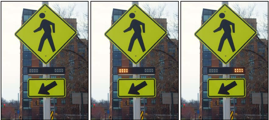
Figure 1. Example of an RRFB dark (left) and illuminated during the flash period (center and right) mounted with W11-2 sign and W16-7P plaque at an uncontrolled marked crosswalk.