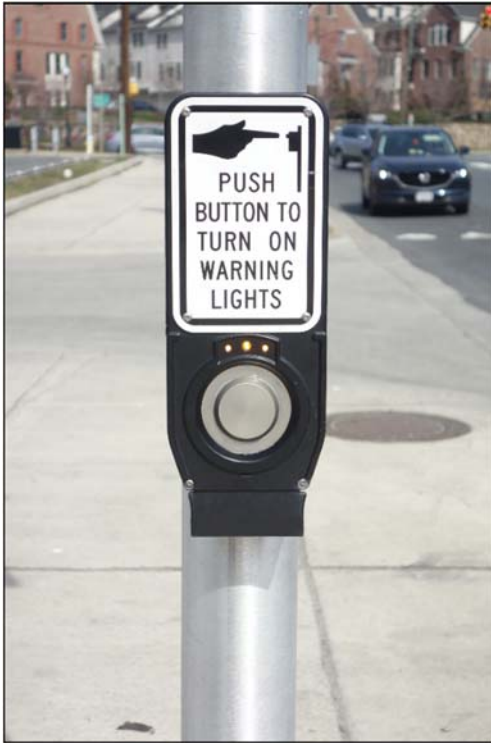
Figure 3. Example of pedestrian pushbutton and R10-25 sign with pilot light for pedestrian actuation.

cc: Associate Administrators Chief Counsel Chief Financial Officer Directors of Field Services Director of Technical Services