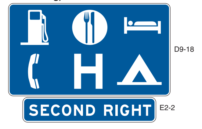
Figure 2E-42. Examples of General Service Signs (with Exit Numbering)

FOOD - PHONE GAS-LODGING HOSPITAL D9-18e CAMPING NEXT EXIT